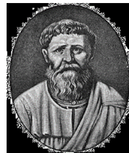
Augustine, soundbite inventor?

We have to keep our eyes set firmly upon God to enjoy creation in all its richness and abundance. Easter shows us that the creator God is willing to go to any lengths to share a relationship with him. He is even willing to sacrifice himself so we can have newness of life in him, the Good News of the Easter message. The resurrection on Easter day changes everything and invites us to share a new relationship of perfect love with him.